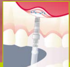
Surgical kit for indirect maxillary sinus lifts Page 27