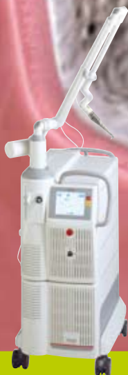
Multi-treatment dental laser platform Page 10