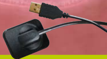
Boxless, digital X-ray sensors Page 33