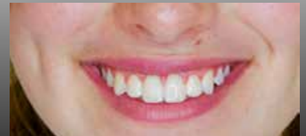
After complete treatment