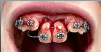
Before treatment / day 0