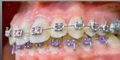
During PBM therapy / Day 8