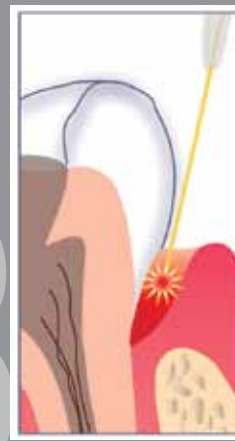
Step 3: Nd:YAG coagulates and leaves a stable fibrin clot.