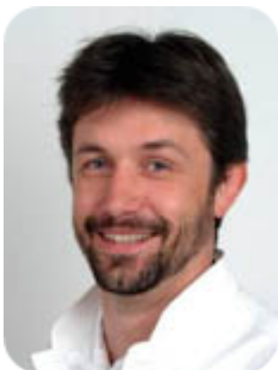
Prof.Dr. Roeland De Moor

Laser activated irrigation in endodontics: "The power of the bubble".