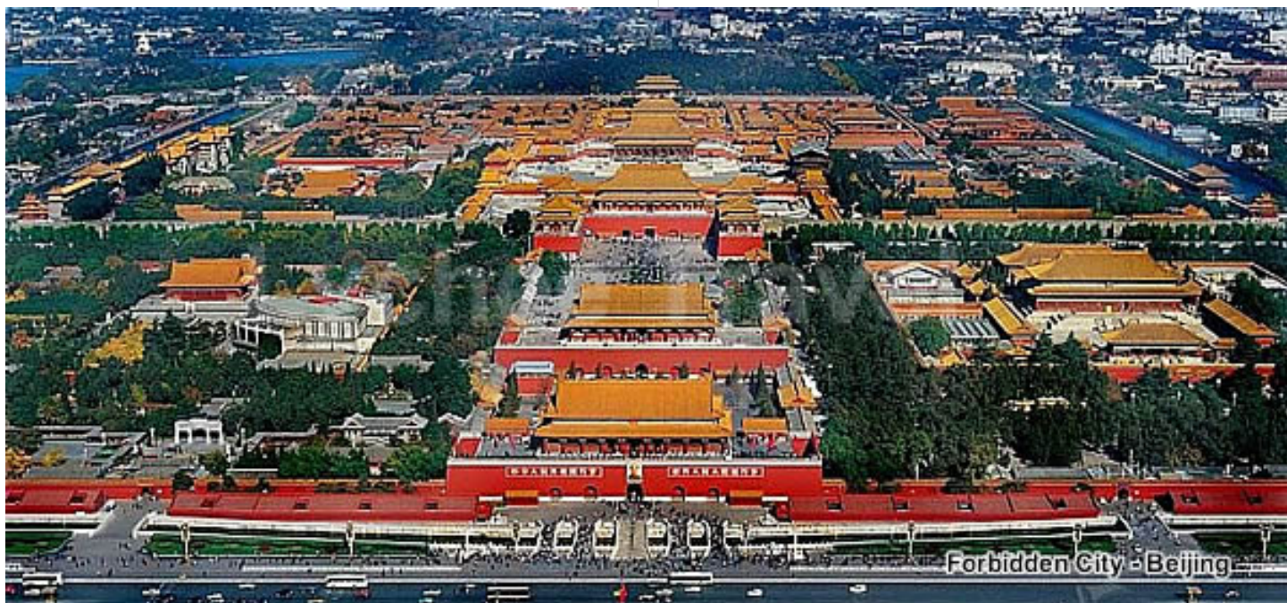
Forbidden City - Beijing