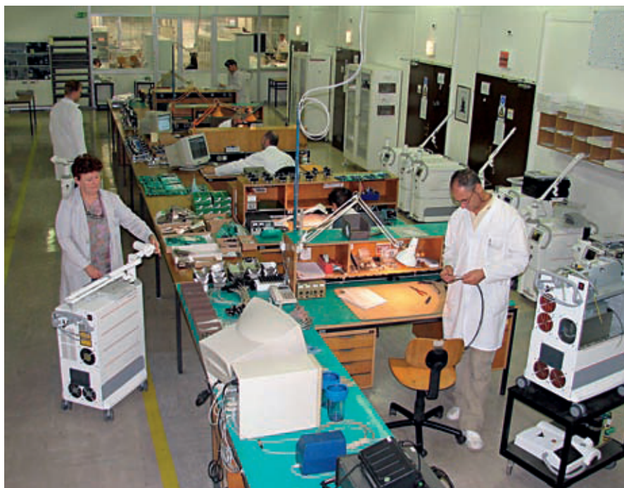
Dedicated Laser Assem- bly Line

Such expertise provides the company with unique advantages, ensuring, among other things, a highly innovative and diligent research and development department that is constantly exploring how new technological advances can be incorporated into both new and existing systems to ensure that Fotona remains a by-word for innovation in laser technologies.