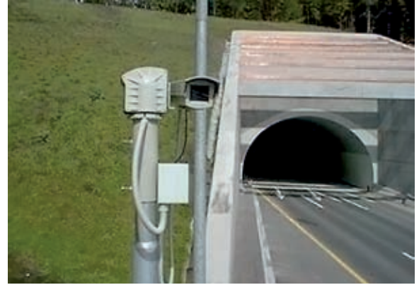
Optical Communications Traffic Control Systems.

producing equipment that services the entire spectrum of products for a modern army. These include observation instruments, fire control systems, control systems, laser irradiation detector systems, thermal imaging systems for night vision and anti-tank missile guidance.