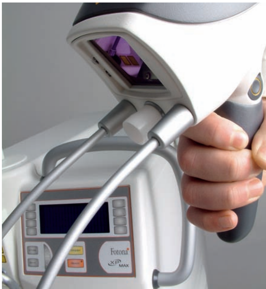
Fotona's revolutionary S-11 Scanner

Slovenia entered the European Union in 2004 as the most prosperous of the 'accession states' and in 2007 will be the only one of them to join the European single currency - the Euro - further evidence of its financial strength and stability.