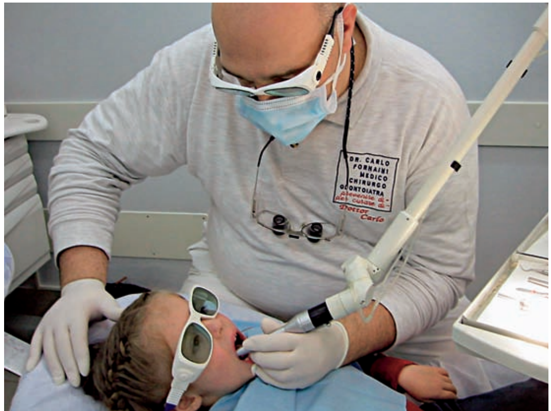
A Fotona dental laser system in operation.

The largest segments of the growing market for lasers in aesthetics and dermatology are laser hair removal and skin rejuvenation. Other markets in-