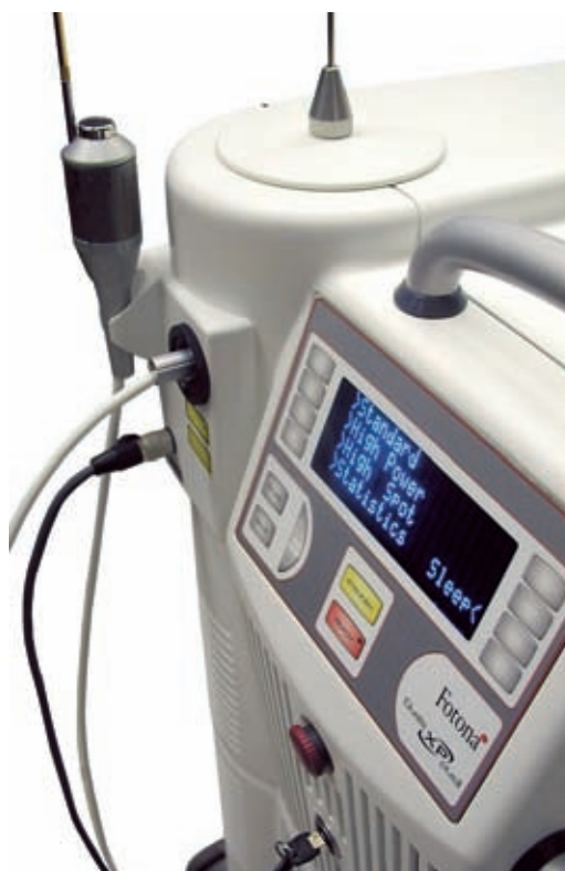
Fotona XP MAX – Fotona's leading Medical Laser System

In the aesthetics market the latest system available from Fotona is the Fotona XP MAX. This system comes with a unique scanner that not only has the fastest scanning speeds and the largest scan area available on the market, but also is the only scanner available that has three spot sizes – 3, 6 and 9mm. In addition Fotona's scanners use a unique sequence of optimal laser spots to ensure the highest levels of patient comfort. Drawing on the success of the Fotona Dualis XP range, the XP MAX is a clear example of Fotona's commitment to produce the highest performance, best-made laser systems in the world.