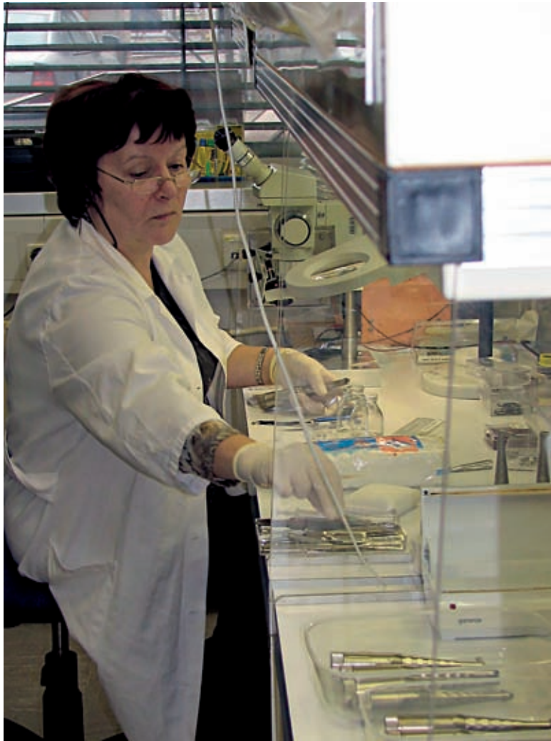
Quality Control on Precision Handpieces

From very modest beginnings, Fotona has grown into one of the leading manufacturers of laser systems in the world. Since their inception over 40 years ago the company has installed over fifteen thousand specialized laser systems all over the globe.