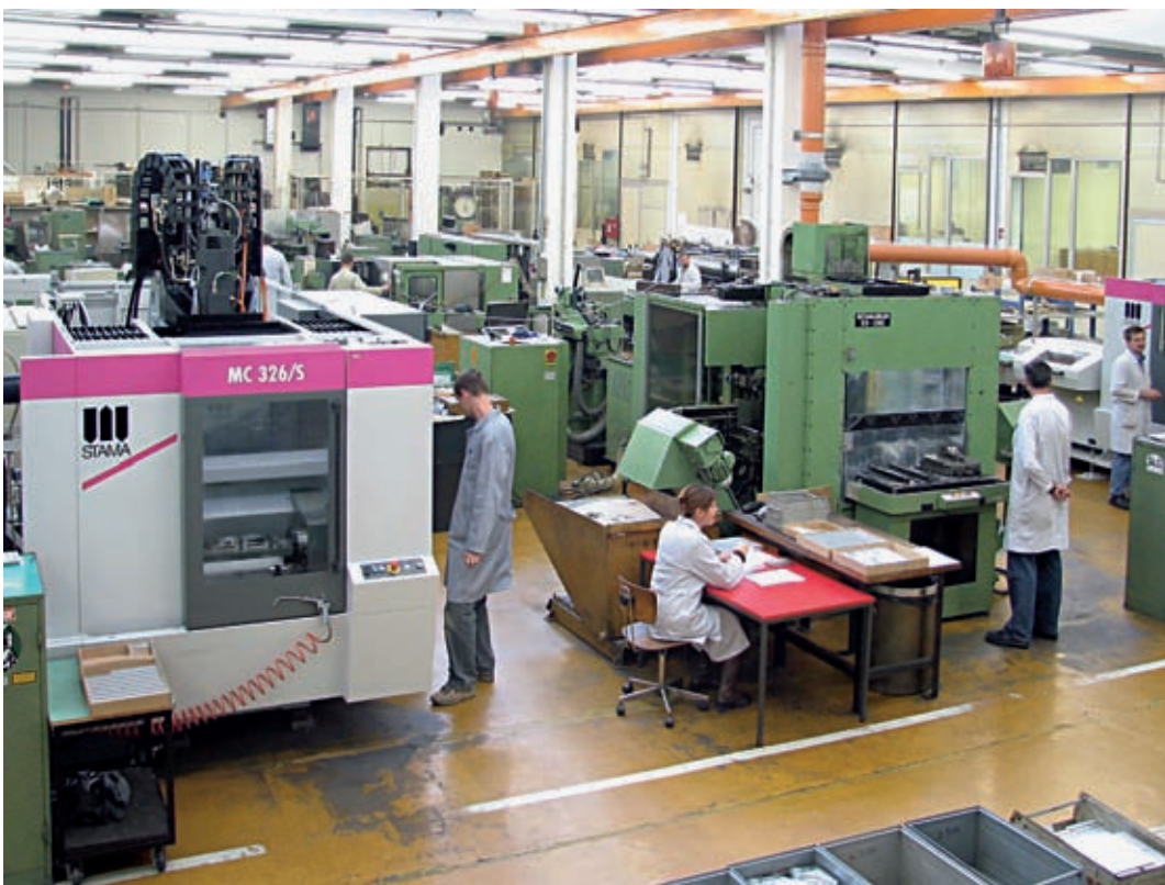
High-Precision Machining Centers