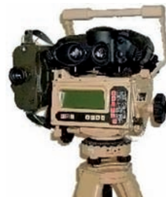
Sophisticated Defense Observation System.

their practical application in range-finder technologies in the defense industry. Fotona consequently began its commercial operations by producing rangefinders for tanks and artillery. Today Fotona maintains its defense arm,