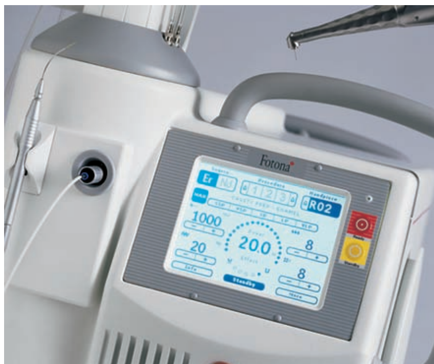
Fidelis Plus III – Fotona's latest Dental Laser System,

more, the Fidelis Plus III also has a unique dermatology upgrade option, which will allow dental practitioners to offer facial aesthetic procedures.