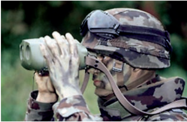
Laser Rangefinder Binoculars.